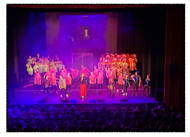
The view from the rafters of this spectacular show