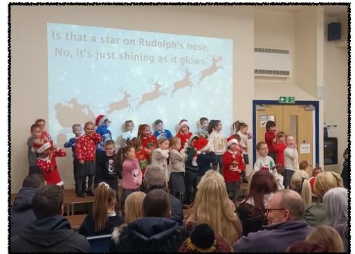
The children of 1S

Finally a huge thank you to staff for all their skills and patience in encouraging and supporting children to have fun and develop their confidence to stand on the stage and perform such wonderful shows.